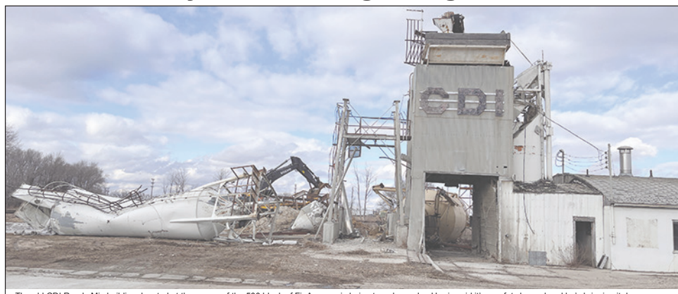
The old CDI Ready Mix building, located at the corner of the 500 block of Fir Avenue, is being torn down. Jay Harris said it's a safety hazard and he's bringing it down

Subscribe to the ... Oakes Times - dedicated to keeping you informed ) News $40 In-County $42 Out-of-County $44 E-Mail $46 Out-of-State 501 Fir Ave #2, Oakes, ND 58474 • 701-742-2361 • oakestms@drtel.net